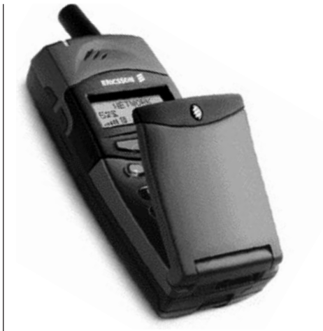
Figure 7 DWOS uses a standard TDMA/136 wireless mobile terminal—any terminal can be used as long as it meets the TDMA/136 specification.

mobile terminal. That is, any terminal can be used as long as it meets the TDMA/136 specification.