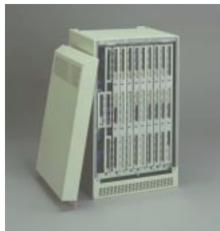
Figure 5 The cellular radio exchange (CRE) is the central point in the radio infrastructure.

The cellular radio exchange, whose function is similar to that of a base station controller (BSC) in a GSM system, is the central point in the radio infrastructure (Figure 5). It controls all radio heads and communicates with mobile terminals over the TDMA air interface by adapting and translating ISDN call control to TDMA call control. The CRE also includes ISDN transmission to the PBX as well as transmission to radio heads and scanners, which includes capability for power-