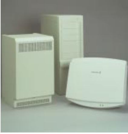
Figure 2 DWOS components.

DWOS and macro systems must be coordinated. Where possible, for the planning of cell parameters and handoff in the network, indoor radio-network planning should be automated. Capacity and coverage-related expansion must be simple and straightforward.