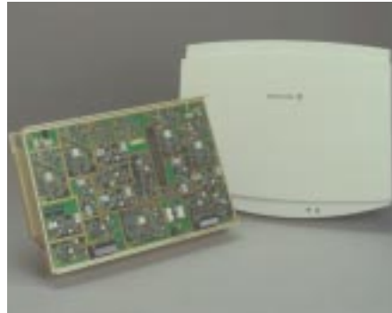
Figure 6 The dual-band radio head is a small, four-liter unit designed for mounting on walls in indoor environments.

The radio head can be powered remotely over the twisted-pair transmission cable (Category 5) from the CRE, which elimi-