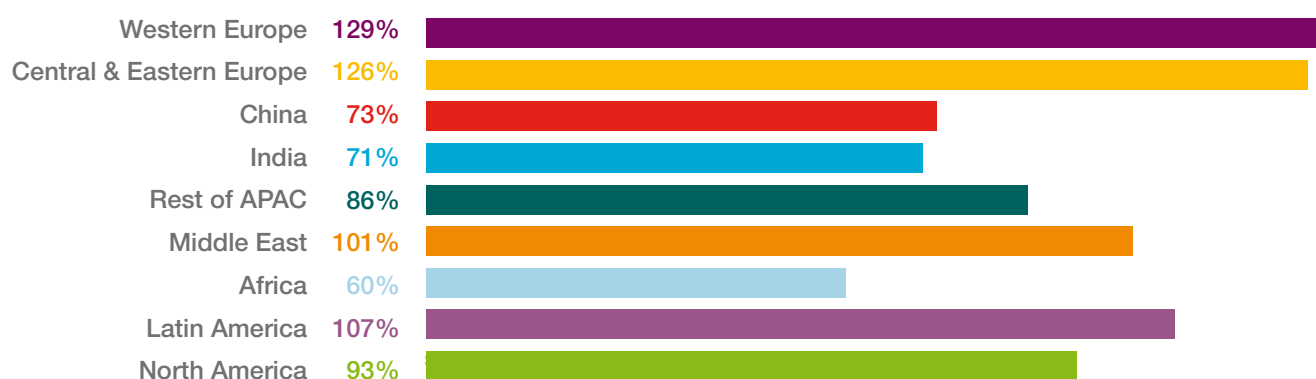
Figure 2: Penetration percentage