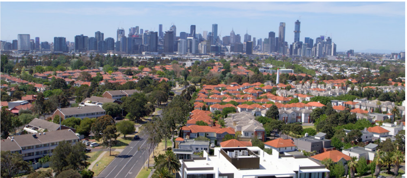
The connected cities of the future will be made greener, safer and more convenient through the use of cellular IoT