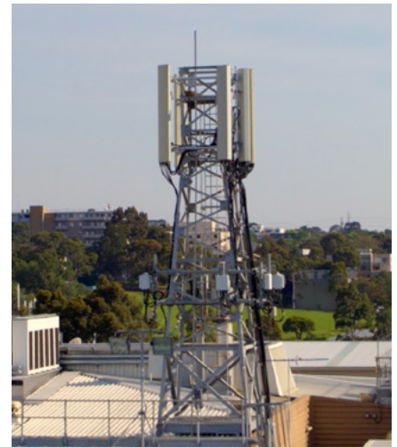
Leveraging existing cellular networks for C-V2X has a huge impact on cost, TTM and scalability