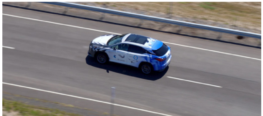
Lexus Australia's role included providing the cars for the trials