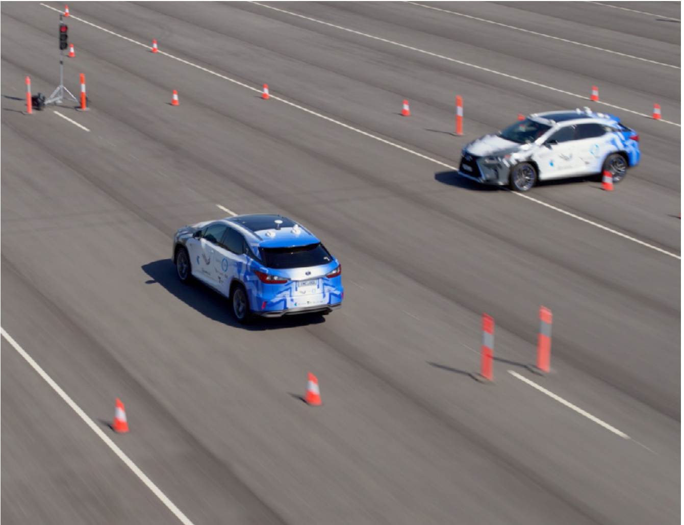
Successful trials of use cases such as the red light violation warning prove the potential of this technology