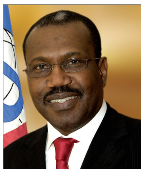
Dr Hamadoun I. Touré

We welcome your feedback and hope that the report will be a springboard for further discussion and action.