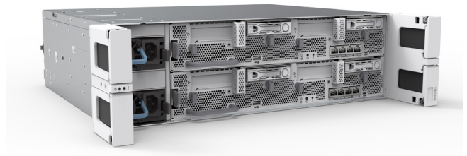
New short form factor CSU-S 02. For edge sites with scarce space or harsh physical environment.

Ericsson Compute Sled Unit – Short format (CSU-S) is a general purpose 1.5U server that is only 350mm deep to fit into sites with scarce space, such as edge sites. It is compliant with NEBS level 3, and equipped with 2nd generation dual Intel® Xeon® scalable processors and up to 2TB of memory.