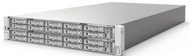
Established form factor CSU 02. For data center and edge sites with data center characteristics.