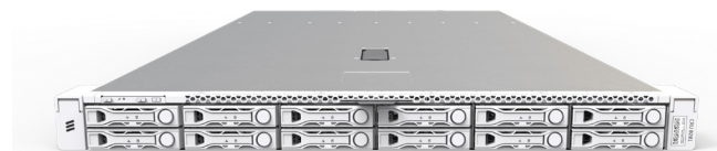
Established form factor CRU 02. For data center and edge sites with data center characteristics.