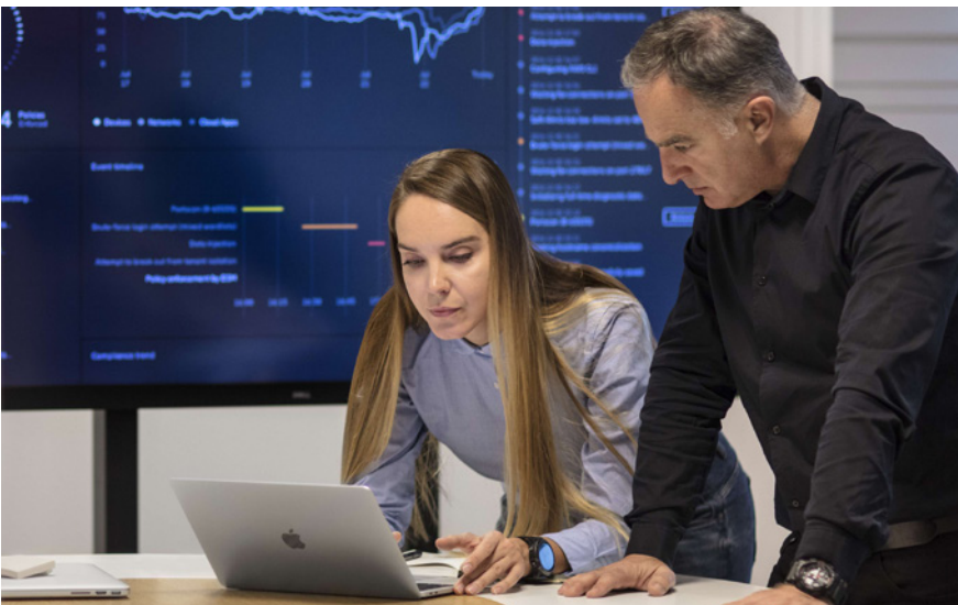
Dynamic Orchestration offers end-to-end assurance, closed-loop processing and flexibility in one solution