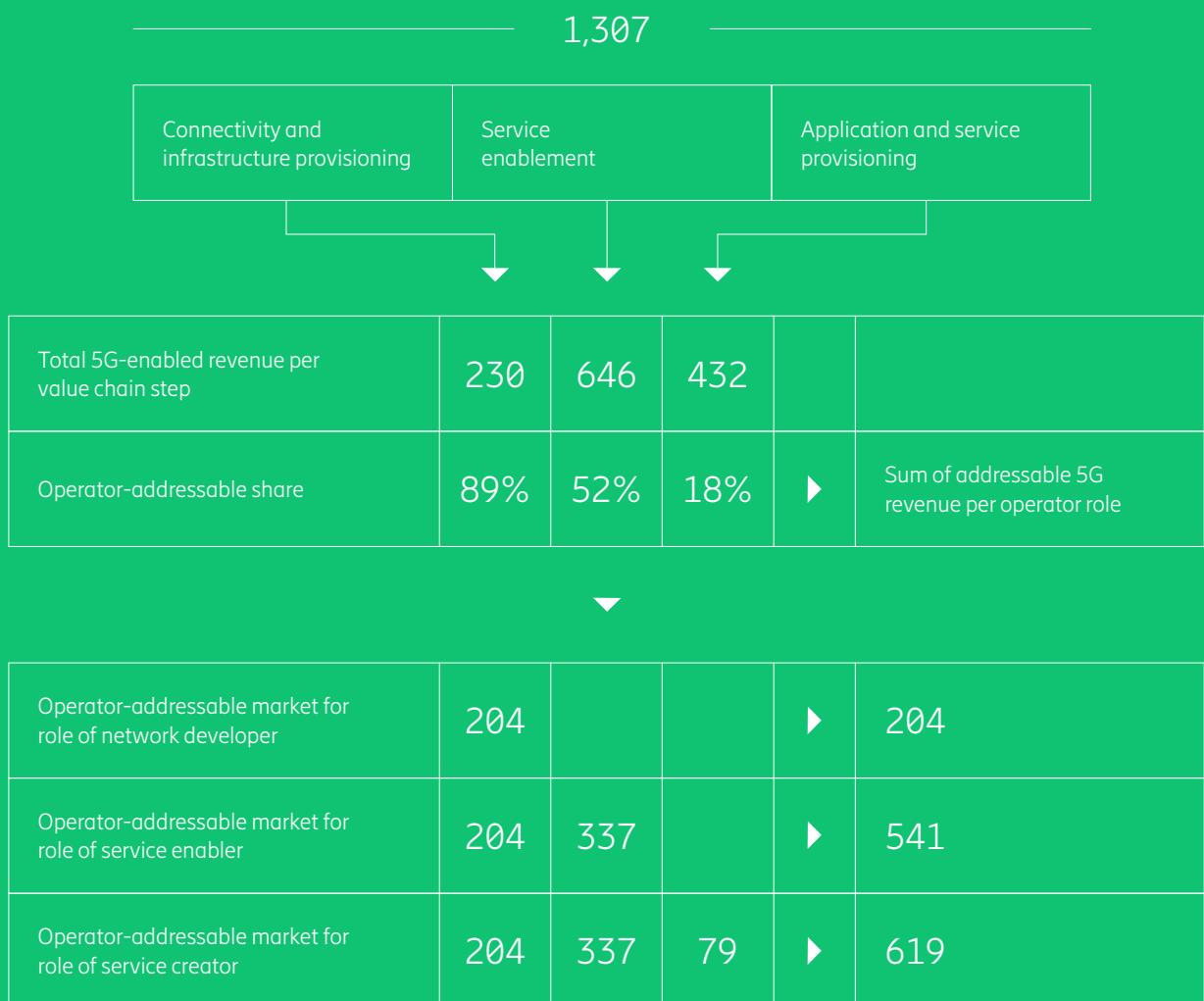
Figure 4: Operator addressable 5G market in ten industries (USD billion)