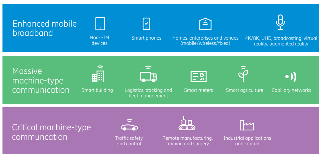
Figure 1: 5G use cases

Ericsson’s longstanding vision of a connected society has become a reality in recent years, with mobile systems acting as a backbone for both the Internet of Things (IoT) and a rapidly expanding range of digital services. We believe that digitalization will continue to transform our industries, lives and society. The 5G system will enable many new use cases [1] that will make the critical role of mobile systems even more apparent than it is now.