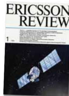
Ericsson Review, issue number 1, 1984.

❖ The Nordic coverage of the television service provided by TELE-X made it a factor to be considered in cultural policy. Technically it was wholly in line with the current international trend. On the other hand the choice of system for the data and video services was singular and motivated by the desire for a system with small, cheap earth stations placed on subscriber premises. TELE-X was a first step towards a Nordic satellite communication system that could lead to a general use of satellite terminals for data and video in the Nordic countries by the end of the 1980s.