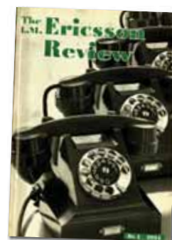
Ericsson Review, issue number 1, 1934.

❖ The new interlocking system at Stockholm Central Station was put in service on March 25, 1933. L. M. Ericsson's Signalaktiebolag and other factories of the Ericsson Group supplied a significant amount of materials for this system and the interlocking systems already in place at the Gothenburg and Malmö Central Stations. This issue described the system, touching on the main technical and economic problems that had to be addressed. The next issue promised several illustrations and text showing the construction of the interlocking machine and the details of the signaling system.